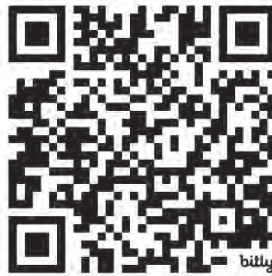
West High Clinic